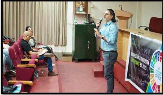
22nd February, 2020

9.8. At Semi-finals of Connect N Change 2019-2020 of Connecting Dreams Foundation, motivating the college students working towards Community Development & Sustainable Development Goals