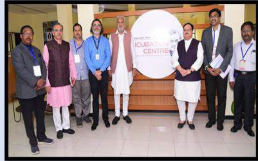
15th January 2020