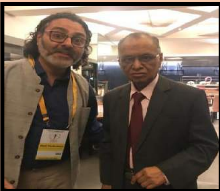
28th January 2020

11.2. With Padma Vibhushan Narayan Murthy, an Businessman, Philanthropist & Co-founder of Infosys at TiEcon Mumbai 2020