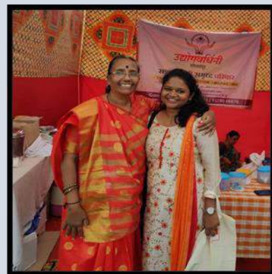
9th March 2020

11.2. With Padma Vibhushan Narayan Murthy, an Businessman, Philanthropist & Co-founder of Infosys at TiEcon Mumbai 2020